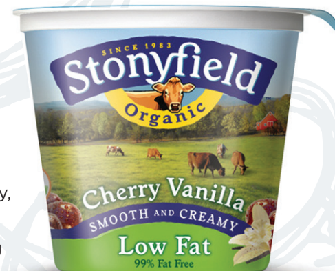
Stonyfield partnered with Pure Strategies to launch new sustainable packaging.